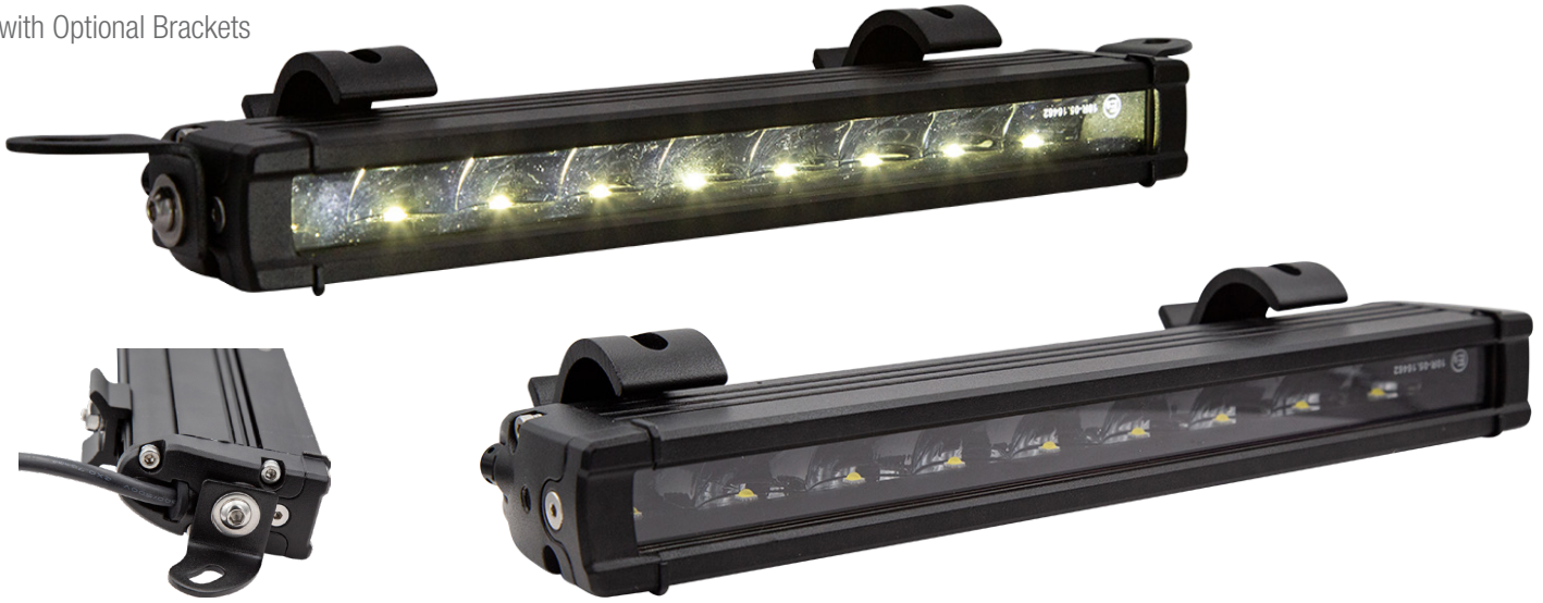
HD11009DBW 9 LED | 2370 Effective Lumen Lit/Unlit