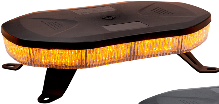
HD112540AC-PM 40 LED | Amber/Clear Lens Lit/Unlit