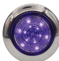
7 LED Amber | Purple