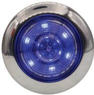
7 LED Amber | Blue