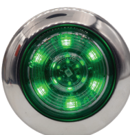
7 LED Amber | Green