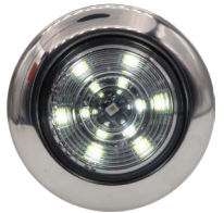
7 LED Amber | White