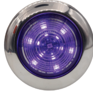
7 LED Red | Purple