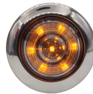
7 LED Red | Amber