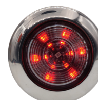
7 LED Amber | Red