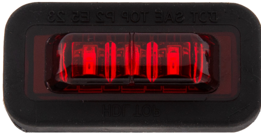
HD15753R 3 LED