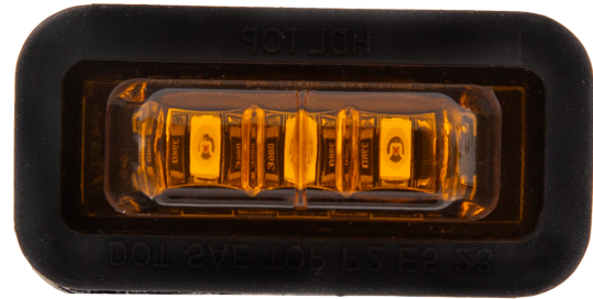
HD15753Y 3 LED