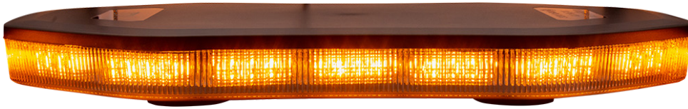
HD187564AC-MM 64 LED | Amber/Clear Lens Lit/Unlit