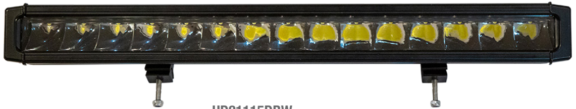
HD21115DBW 15 LED | 8352 Effective Lumen Lit/Unlit