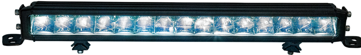
with Optional Brackets