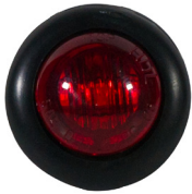
HD34003-3RSMD 3 LED