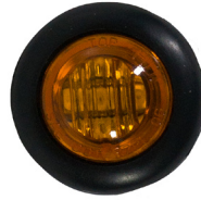
HD34003-3YSMD 3 LED