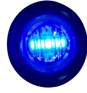
HD34003-3BCSMD 3 LED | Clear Lens