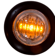
HD34003-3YCSMD 3 LED | Clear Lens