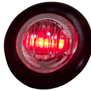
HD34003-3RCSMD 3 LED | Clear Lens