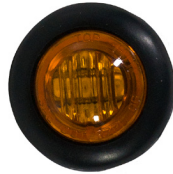
HD34003YSMD 3 LED