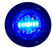
HD34003BCSMD 3 LED | Clear Lens