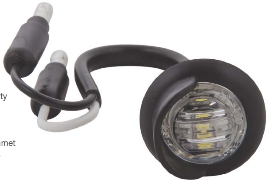
HD34103WSMD White Lens