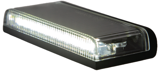
HD35023AW 23 LED | Amber/White