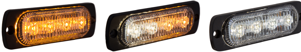
HD37401A 4 LED