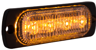
HD37401A 4 LED