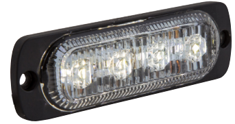
HD37401W 4 LED