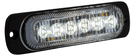
HD37601W 6 LED