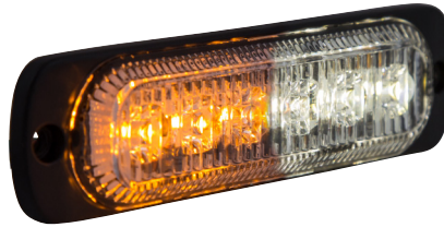
HD37601AW 6 LED