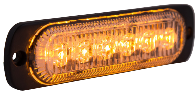
HD37601A 6 LED