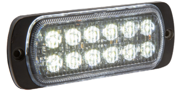
HD37611W 12 LED