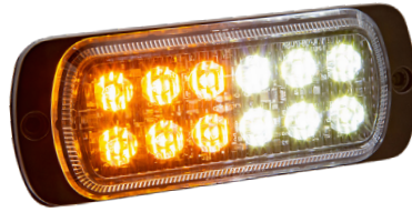
HD37611AW 12 LED