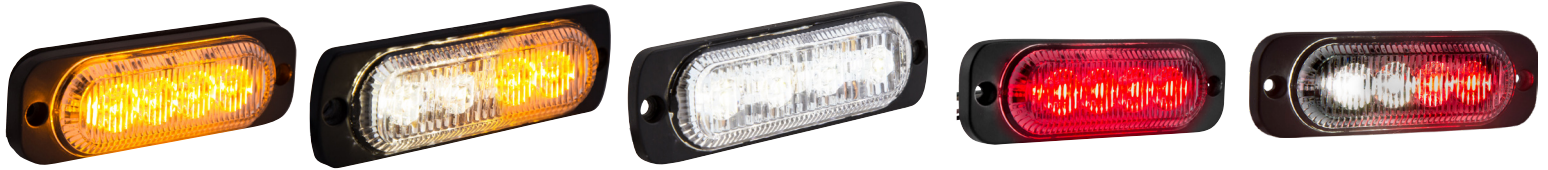
HD38401A 4 LED | Amber