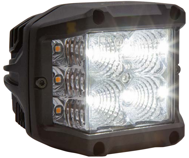
HD38510AW 10 LED | Flood