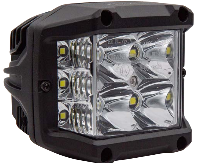
HD38510F 10 LED | Flood

ADDED SIDE SHOOTING BEAM FOR BROADER COVERAGE