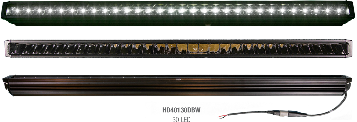
HD40130DBW 30 LED