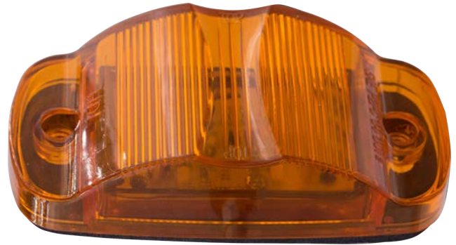
HD42012YSMD 12 LED