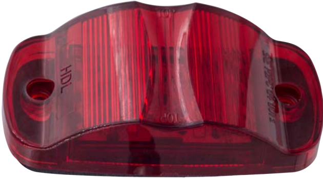
HD42012RSMD 12 LED