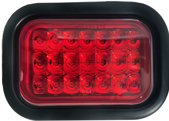
HD50021RSD 21 LED | Red Lens Shown with Grommet

5" Rectangular, Red Stop Tail Turn Light designed with the fleet in mind. Rugged electronics include large Super Duty diodes for excellent light output. Features that make this a great choice include: The use of Industry Standard 3-Pin Connectors. Standard Size makes retrofit or replacement quick and easy. Low amperage draw for fewer battery and charging system problems. 100,000 hour lifetime. Rating Designed for use in all 12 volt systems.