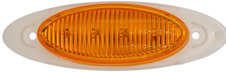
HD52004Y 4 LED