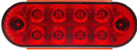
HD60010R-AMP Stop Tail Turn | 10 LED