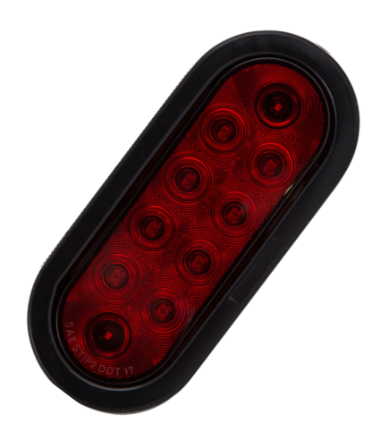
HD60010RSMD 10 LED | Red Lens Shown with Grommet

6" Oval, Red Stop Tail Turn Light designed with the fleet in mind. Rugged electronics include industry leading SMD diodes for excellent light output and durability. Industry Standard PL3, 3-Pin Connectors and standard size makes retrofit or replacement quick and easy. Low amperage draw for fewer battery and charging system problems. Complimentary Amber Park Turn and White Back up lights also available. 100,000 hour lifetime rating designed for use in all 12 volt systems.