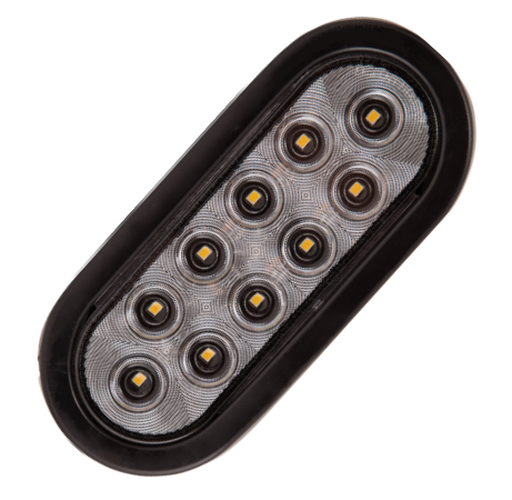
HD60010WSMD 10 LED | Clear Lens Shown with Grommet