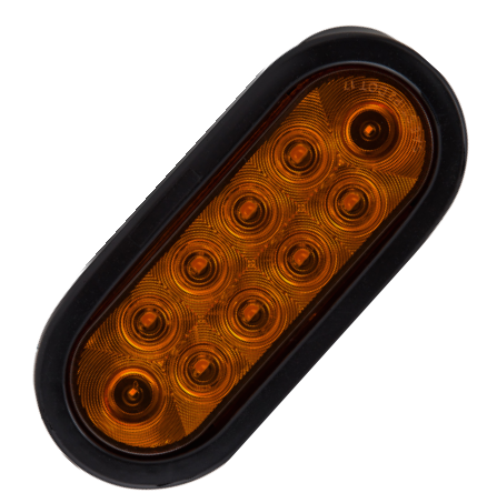
HD60010YSMD 10 LED | Amber Lens Shown with Grommet