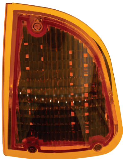
HD67045LY 45 LED